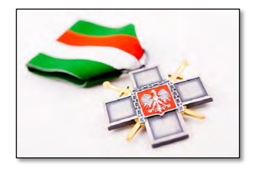
The Siberian Exiles Cross medal.