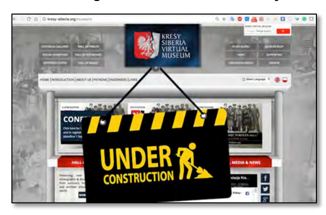
Kresy-Siberia Virtual Museum upgrade is underway.

The Kresy-Siberia Virtual Museum website is our flagship program, comprising 9 Historical Galleries with 29 Exhibition Rooms, nearly 800 Survivor Testimonies, over 15,000 photos and other graphics, and over 67,000 names on the Wall of Tribute. However, the website is now over 8 years old and the internet world has moved on radically. We know that the online visitor experience needs improving, that website access is often unreliable and that we are increasingly vulnerable to hacking attacks.