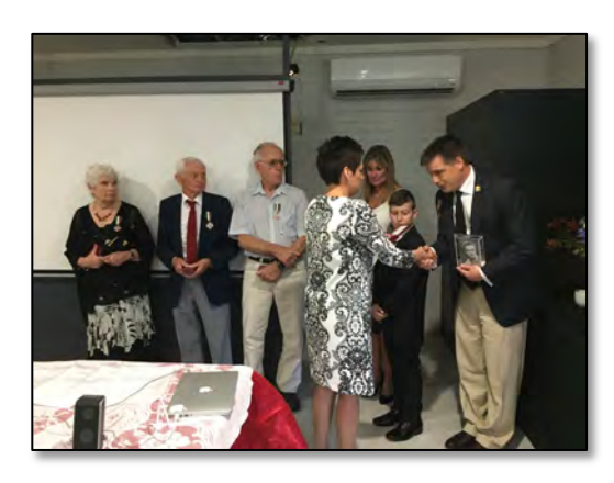
Siberian Exiles Cross presentation in Coffs Harbour, Australia.

The Kresy-Siberia Foundation sponsored the awarding of 7 Siberian Exiles Cross medals in Australia, England and the USA in November 2017. This state medal is awarded by the President of the Republic of Poland to Survivors of World War II Soviet deportation, or to their families, if they are now deceased but were still alive on 1 January 2004.