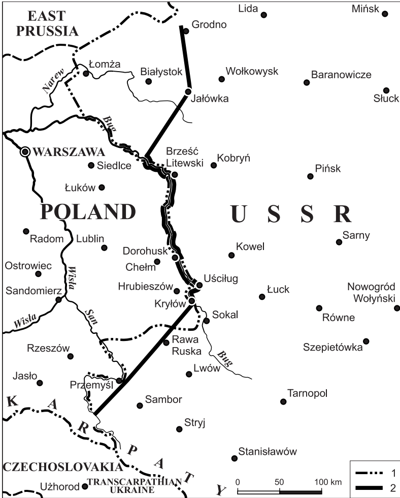
Figure 4. The Curzon Line according to the Soviet view. State boundary: 1 – of the USSR; 2 – the Curzon Line.