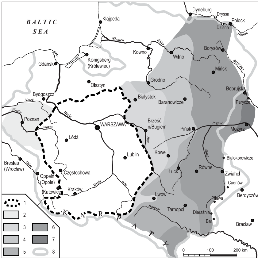
Figure 3. The effects of the military operations of the Polish army. Areas taken in the period between the end of 1918 and the beginning of 1920. Signatures: 1 – November 1918; 2 – January 1919; 3 – February 1919; 4 – May 1919; 5 – July 1919; 6 – August-December 1919; 7 – March 1920; 8 – Dmowski line.