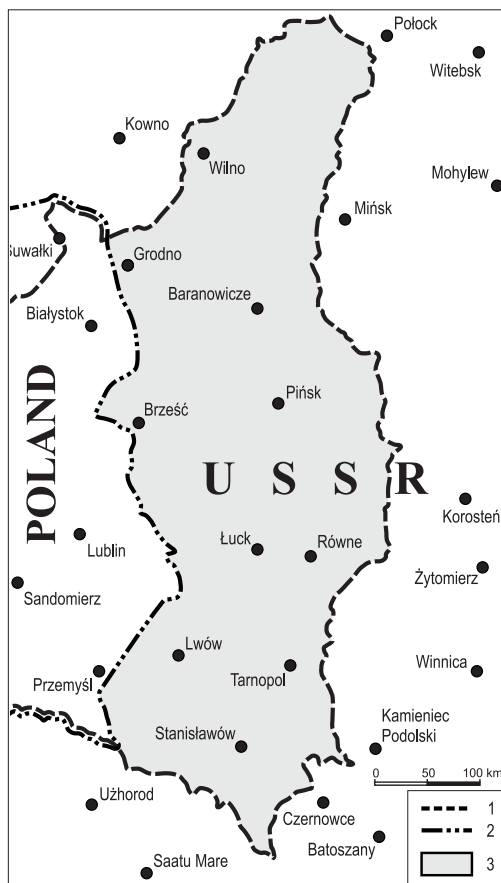
Figure 6. Eastern boundary of Poland (1921-1939 and after 1945). Signatures: 1 – eastern boundary of Poland according the Treaty of Riga (March 18th, 1921); 2 – eastern boundary of Poland according to the Polish-Soviet agreement of August 16th, 1945; 3 – territories lost by Poland to the advantage of the USSR.

As a consequence of the loss of eastern territory and the gain of a significant compensation in the west, Poland re-emerged in a new, completely transformed territorial shape. After the enormous resettlements of the population, Poland became an ethnically homogeneous country. The overall losses and gains can hardly be precisely balanced. Wrocław, Szczecin, Gdańsk and Olsztyn became Polish cities. Besides, Poland gained a broad seacoast. The eastern boundary of Poland moved far to the west, from the dividing line established through the Treaty of Riga to – roughly – the Curzon Line. At the same time, the western boundary was moved from the line determined by the Treaty of Versailles to the course of the Odra and Nysa Łużycka Rivers. For these reasons, in the assessment of the consequences of the Polish eastern boundary being established according to the Curzon Line, the comprehensive balance of territorial changes, having ultimately led to the appearance of Poland within the boundaries decided in Yalta and Potsdam, must be accounted for.