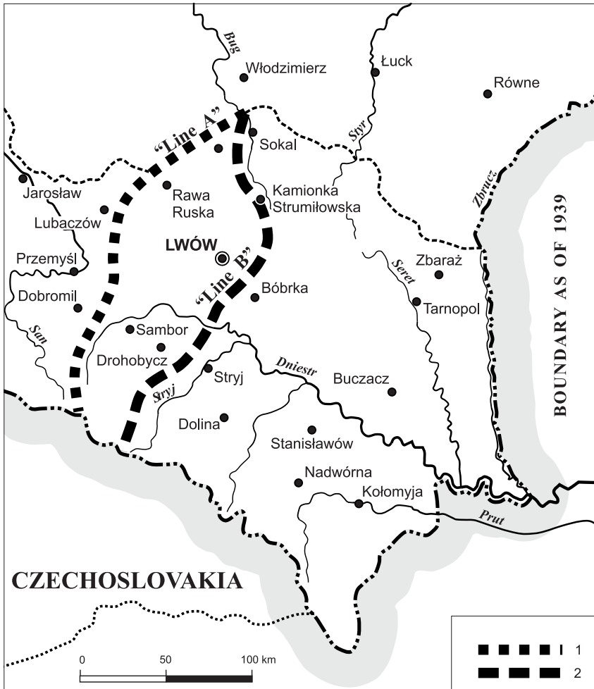
Figure 2. Division of Galicia according to the later Curzon Line (variants 'A' and 'B'). Signatures: 1 - Curzon Line 'A'; 2 - Curzon Line 'B'.