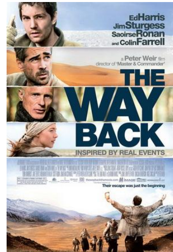
Starring Jim Sturgess, Colin Farrell, and Ed Harris